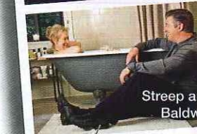
Streep and Baldwin