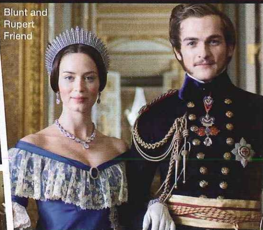
Blunt and Rupert Friend

WILD WOMEN Emily Blunt is a headstrong queen in The Young Victoria , while The Loss of a Teardrop Diamond casts Bryce Dallas Howard as a hard-to-handle heiress. CRIME BUSTER Robert Downey Jr. takes on the famous title role in Sherlock Holmes . THE EX FACTOR A divorced couple (Meryl Streep and Alec Baldwin) rekindle their romance in It's Complicated . TALL TALE Young Valentina's fate is at stake in the surrealist The Imaginarium of Doctor Parnassus .