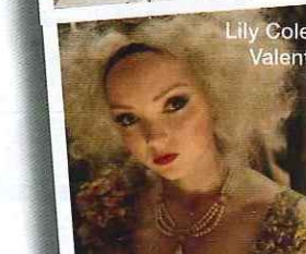
Lily Cole as Valentina