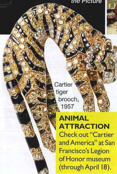
Cartier tiger brooch, 1957

ANIMAL ATTRACTION Check out "Cartier and America" at San Francisco's Legion of Honor museum (through April 18).